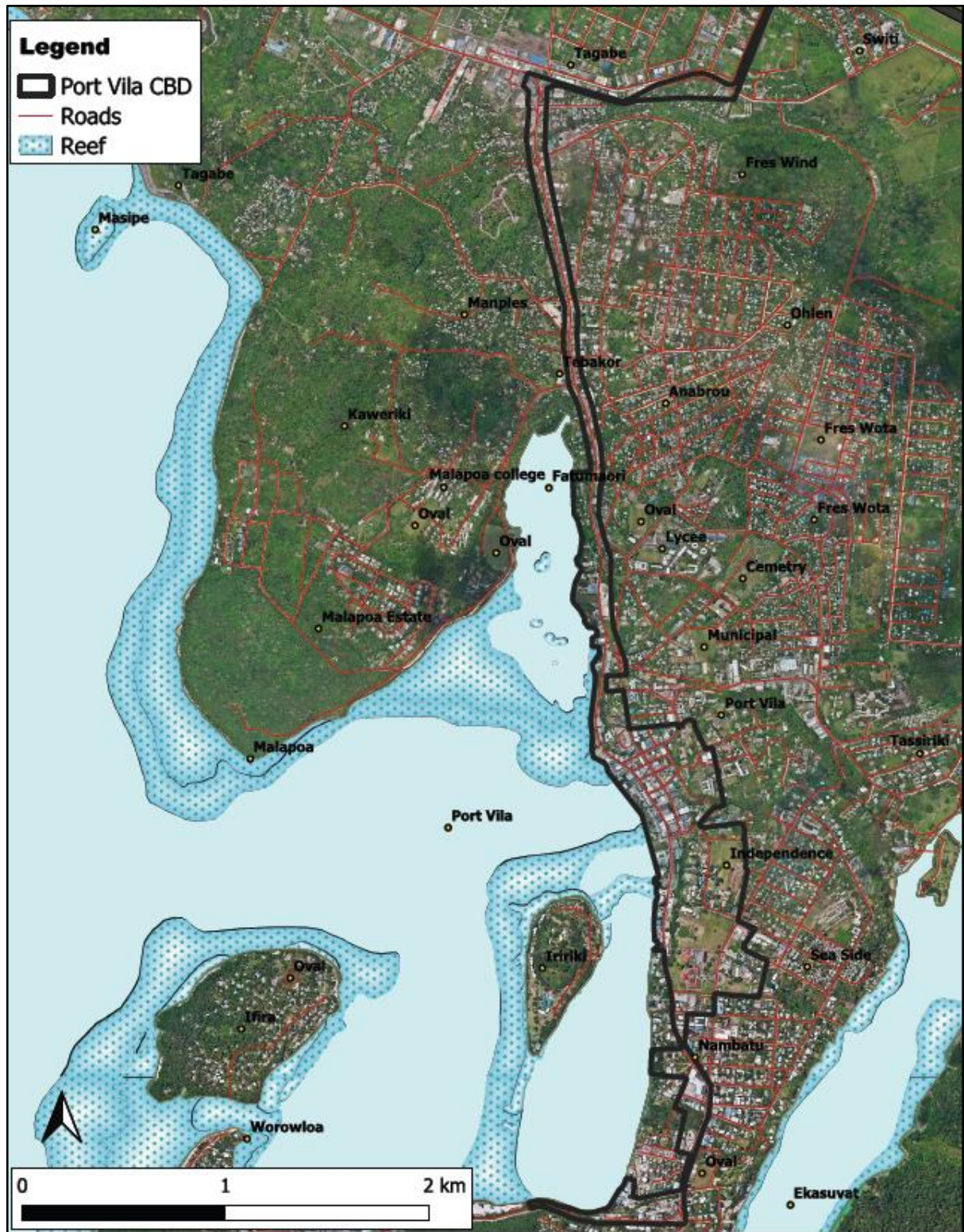
Figure 2 Port Vila CBD map

There is a need for a more strategic approach to Port Vila's CBD greening, Vanuatu has advanced with their urban policies, but issues of land tenure and complexities of urban growth have slowed the progress of urban greening including its central business district. National