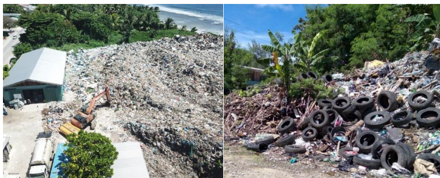
Figure 1: Jable–Batkan Dumpsite, Majuro

As with much of the Pacific (and indeed globally), changed consumption patterns over the decades away from traditional practices to a disposable society without ability to manage waste in a sustainable way has now resulted in solid waste generation exceeding the RMI capacity to manage it effectively. Without viable alternatives, the RMI have relied primarily on disposal of waste to dumps – in particular the main dumpsite at Jable–Batkan in Majuro. This dumpsite has long exceeded its design capacity with waste now pushed up to 17m high against a seawall on the ocean side of the atoll (see photos).